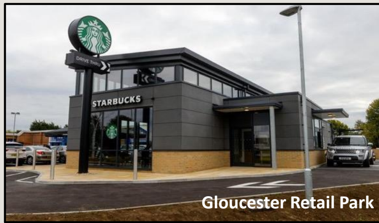
Gloucester Retail Park