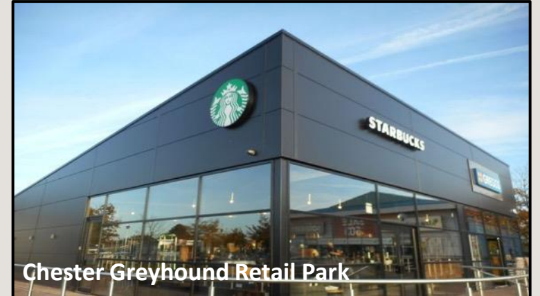
Chester Greyhound Retail Park