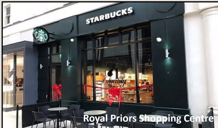
Royal Priors Shopping Centre