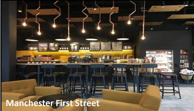
Manchester First Street