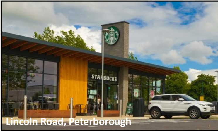
Lincoln Road, Peterborough