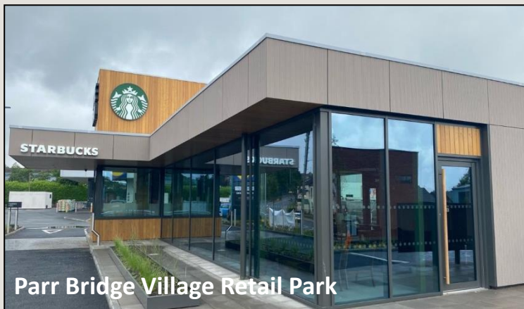
Parr Bridge Village Retail Park